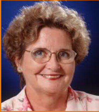
Dame Carol Kidu Only Female MP in PNG

“What we need are not just a few women who make history, but many women who make policy.”