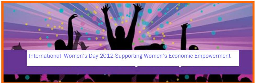
International Women's Day 2012-Supporting Women's Economic Empowerment

The 2012 IWD theme is "supporting women's economic empowerment." UN Women will focus our fundraising efforts on economically empowering women in the developing world. In particular, UN Women Australia will be supporting women in our region to access land to enable them to be economically independent, to provide them with the resources to grow their businesses and to provide food security for them and their families.